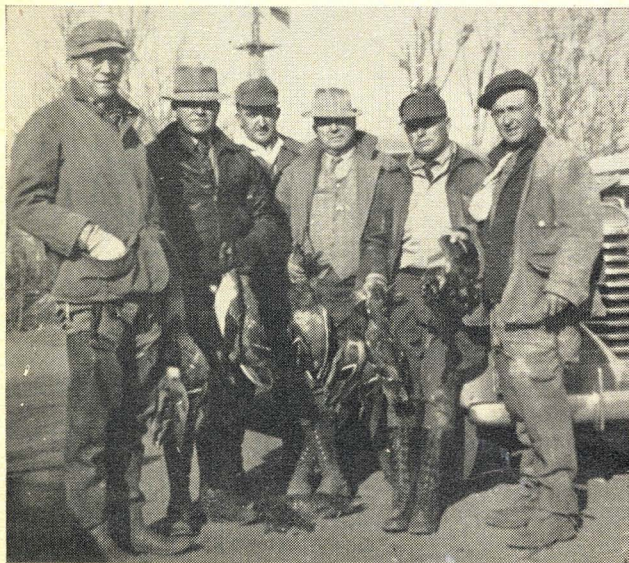
A Day's Hunt in Western Kansas

The Commission, in an attempt to take the racket out of beaver trapping, will use its field employees and live traps in removing the animals from areas where they are complained against. Heretofore, trappers were employed on a fifty-fifty basis. They would trap the animals, care for the pelts and receive one-half of the proceeds from the pelt, sold by the commission. Under the present plans of the commission, these animals will not be killed, but trapped alive and moved to areas where they are wanted.