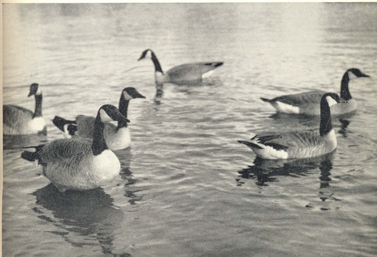
GEESE ON A STATE LAKE

Beaver and otter are protected under the Kansas law. The law provides also that no person shall use in the aggregate more than thirty steel traps, snares, deadfalls or other devices.